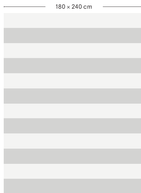
L stripe (20 cm)