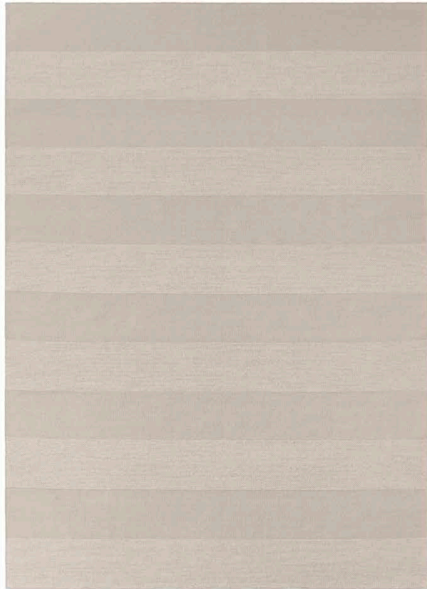
Souma Stripe L 0303