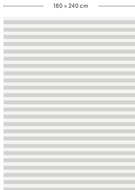
S stripe (5 cm)