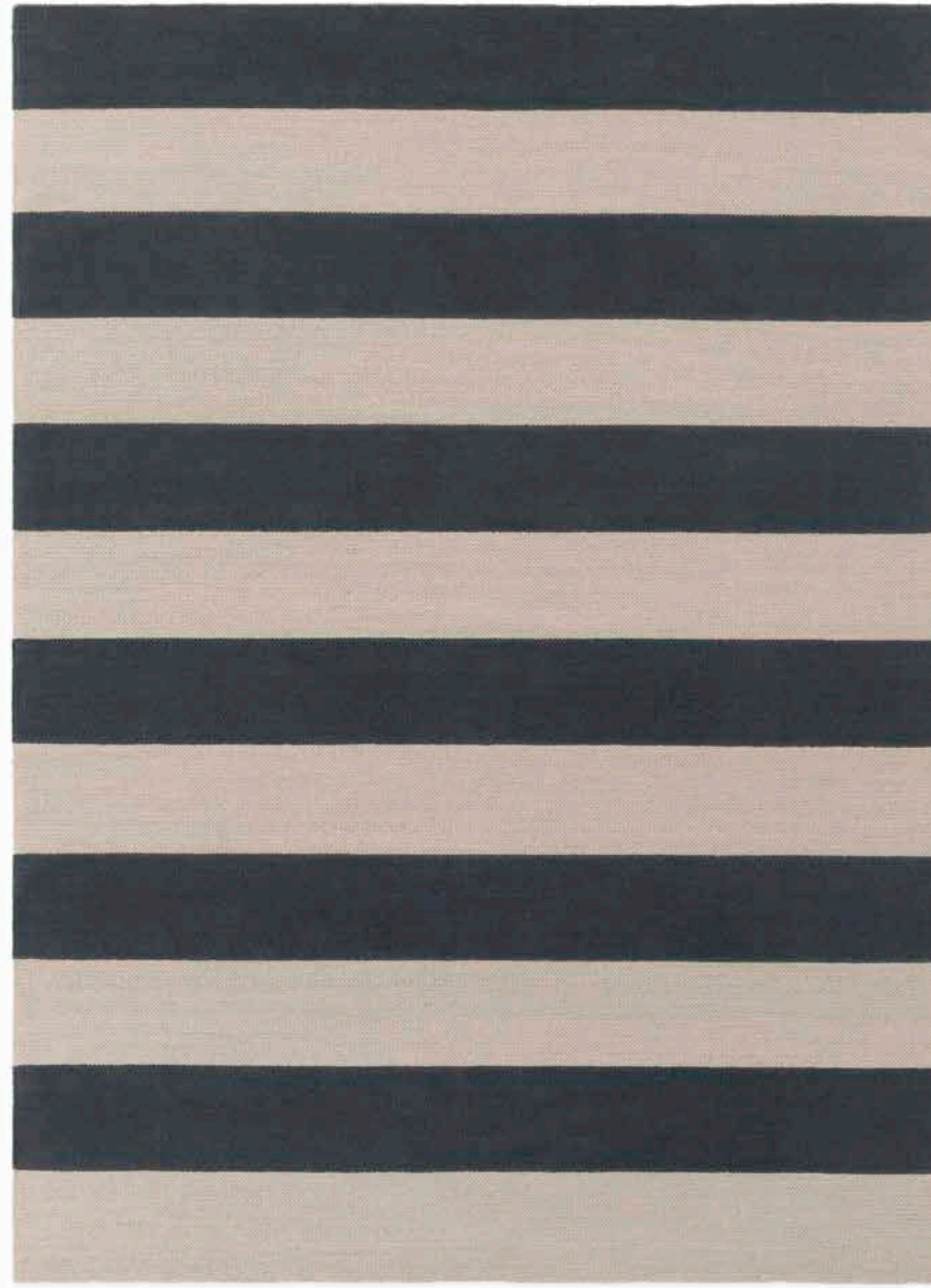
Souma Stripe L 3303